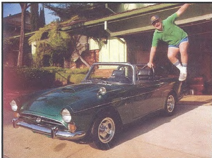
Not so recent picture of "skinny" me with my Sunbeam TIGER.